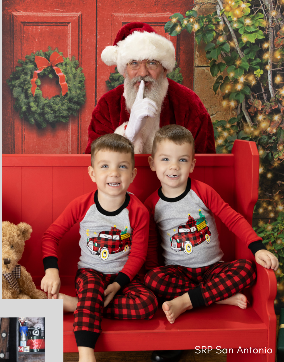
SRP San Antonio